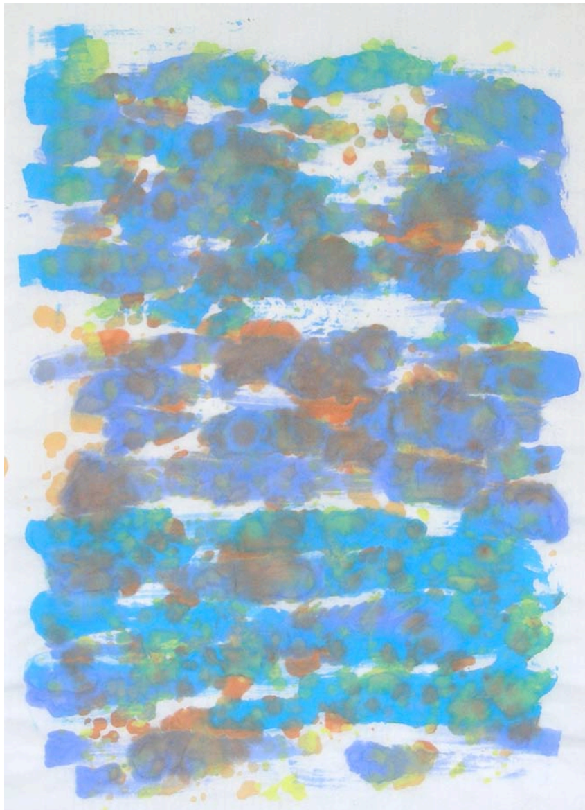
Johanna Abraham Untitled 2012 Watercolor on tissue paper