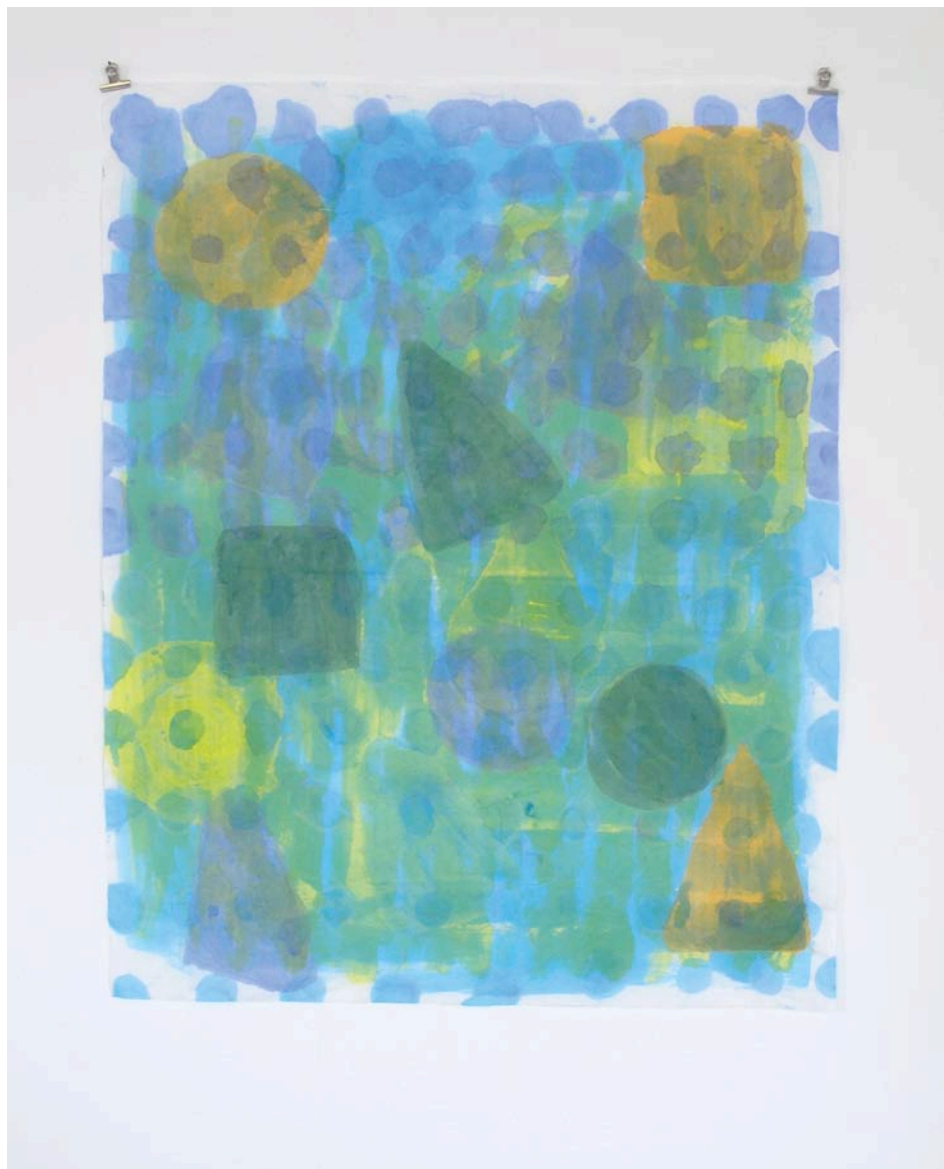
Johanna Abraham Untitled 2012 Watercolor on tissue paper